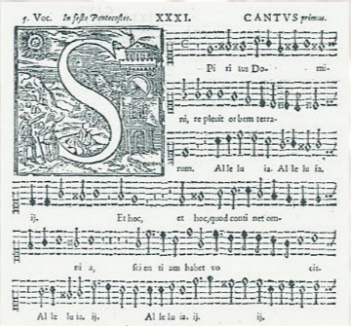
Page from Byrd's 'Gradualia'

This village is but a few miles from Ingatestone Hall, the home of the Petre family and a centre for Catholic activity in the area. Byrd seems to have been a regular visitor at the Hall from about 1586 onwards and he spent the whole of the Christmas season there in 1589. It may be that Byrd was tired of life in London or was unhappy at the increasing anti-Catholic bias of the government but in either case he moved to Standon Massey permanently from about 1594. Much of his music from this point would have been inspired by, if not directly written for, the clandestine services which took place around Ingatestone, including the three settings of the Mass and the two books of Gradualia published in 1605 and 1607. In his will, Byrd asked to be buried in Standon Massey near his wife. It is unlikely that the Parish Church was the site of his burial - Byrd