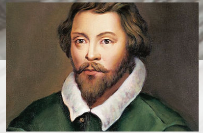
William Byrd (1539 - 1623)

The decision to perform every note of William Byrd's Latin church music in a series of concerts around the UK seemed a logical next step for The Cardinal's Musick. Having completed a thirteen CD survey of the music in Latin we were struck not only by the astonishingly high quality of the compositions but also by the sophistication of the composer's wit and the intensity of his emotion. Too little of this great man's music is heard regularly and the Byrd Tour 2012 hopes to redress this situation with sixteen concerts around the UK which will allow every note of his music in Latin to be heard in the space of one year. Central to this tour are performances in some of the places which were important to Byrd and his supporters - Standon Massey (Essex), Winchester, Fotheringhay and Arundel.